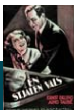
Film poster 1932