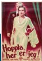
Film poster 1933