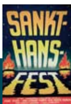
Film poster 1947