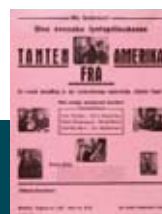
Film poster 1943