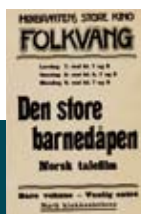
Film poster 1932