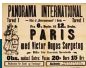
Theatre poster ca 1890