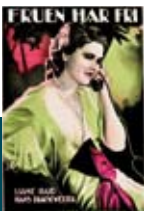
Film poster 1932

In June 2004 began the move into the new and long needed underground stacks. Unlike the previous vaults and storage areas in Oslo, the stacks are now climate controlled at 18 °C with a relative humidity of 45 %. The stacks are primarily intended for day-to-day use with daily traffic in and out. The stacks hold 42,000 shelf meters, including photography and map cabinets.