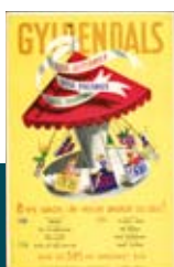
Advertising poster 1950

The web site was frequently visited in 2004, judging by the number of inquiries and orders for copies of photographs from visitors to www.nb.no/baser/1905 .