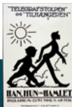
Film poster 1932