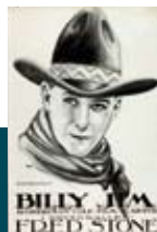
Film poster 1920

The Sami bibliography is a catalogue of literature in Sami, and also in Norwegian or other languages if they have a Sami relevant topic. It covers publications in Norway 1945–1987 and from 1993 to the present. By Sami relevant literature is meant all different books, chapters and paragraphs from books, pamphlets, articles in periodicals and yearbooks, teaching material, official publications and audio books. The Sami bibliography collects, documents and visualizes the Sami cultural heritage and is important in the development of Sami library and information work. www.nb.no/baser/samisk